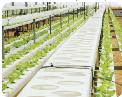
Detached cover NFT gutters system