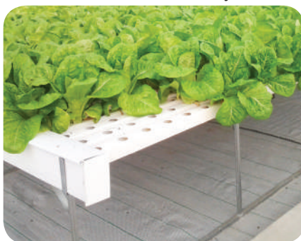
Closed NFT Gutters system